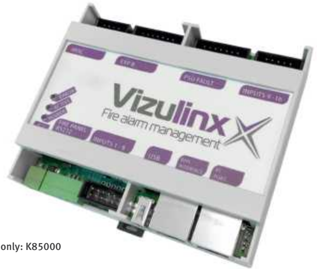
Module only: K85000

*BACnet support currently only available for Taktis systems