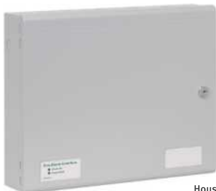
Housed version: K85000 M2

Vizulinx can be used with Kentec's full range of Addressable and Conventional fire alarm systems.