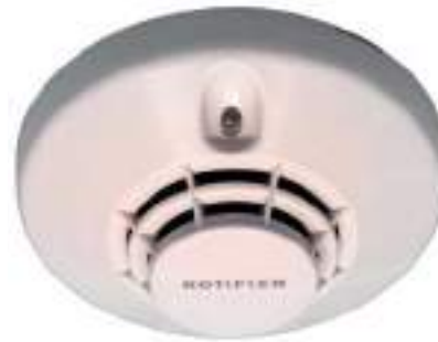
ND-751P-E Intelligent Plug-in Photoelectric Smoke Detector

©2006 Honeywell International Inc. All rights reserved. Unauthorized use of this document is strictly prohibited.