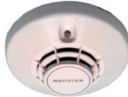
ND-751T-E Intelligent Plug-in Thermal Detector

©2006 Honeywell International Inc. All rights reserved. Unauthorized use of this document is strictly prohibited.