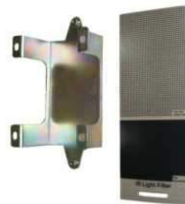
1 pc. Mounting Bracket